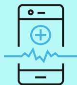
eCOA Web or App